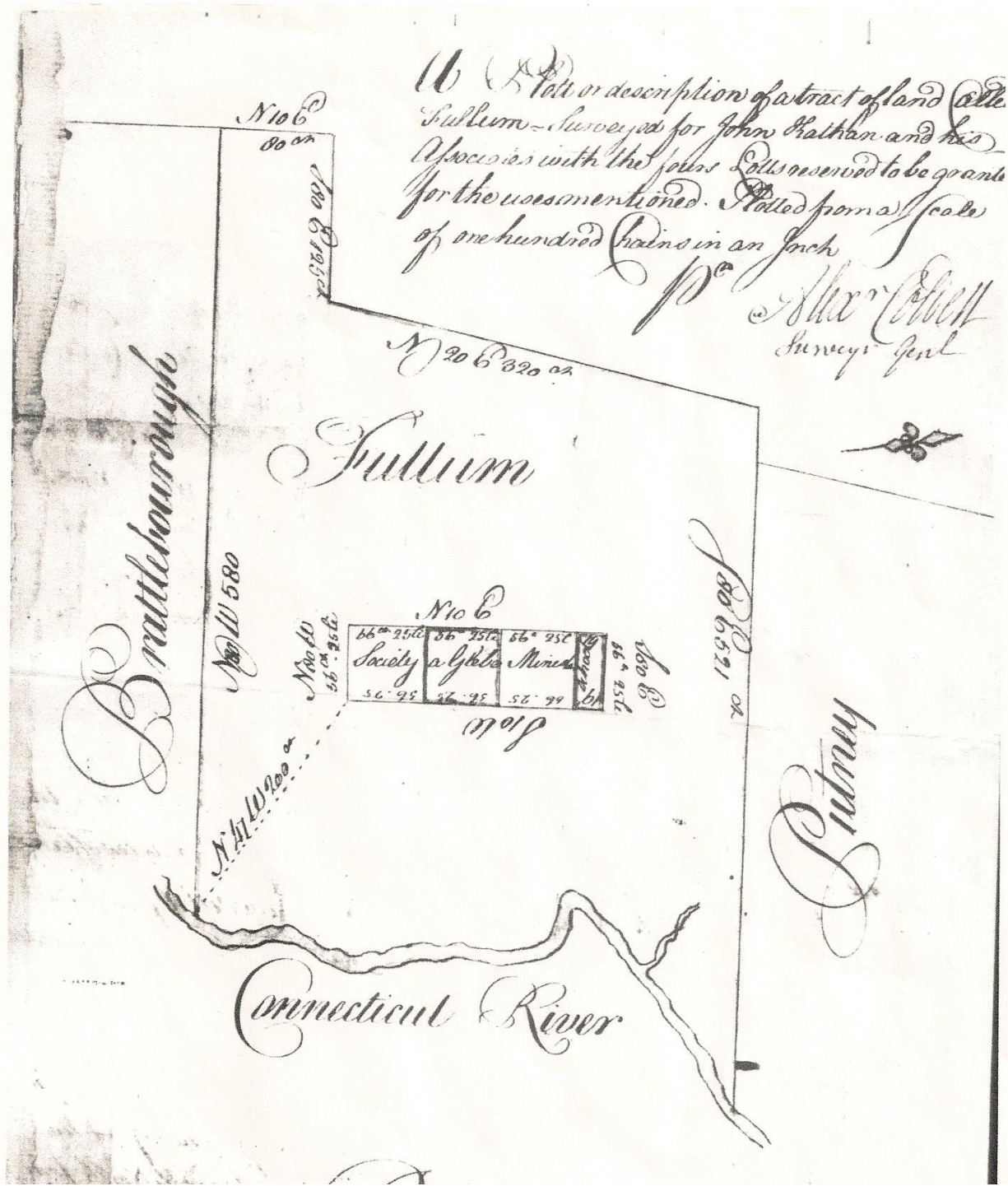
1766 Land Survey, Pages 5-7.